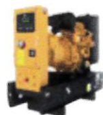
Cat® C2.2 Diesel