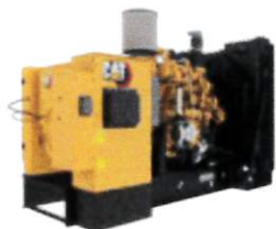
Cat® CG18 DG500